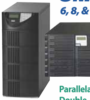
Full Three Year Warranty

Parallelable, Single-Phase Double-Conversion