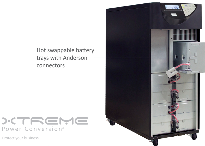
T90-6K front view (panel removed)

For extended runtimes and detailed requirements, see www.xpcc.com/selector . Runtimes are shown in minutes and will vary based on battery condition, age, cycles, and ambient temperature. Optional 1000W charger recommended for applications requiring three or more battery packs.